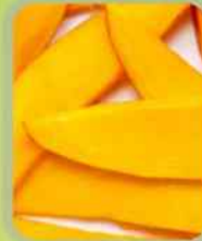
FROZEN ALPHONSO MANGO SLICE