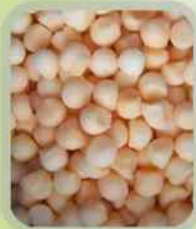
IQF CANTALOUPE BALLS