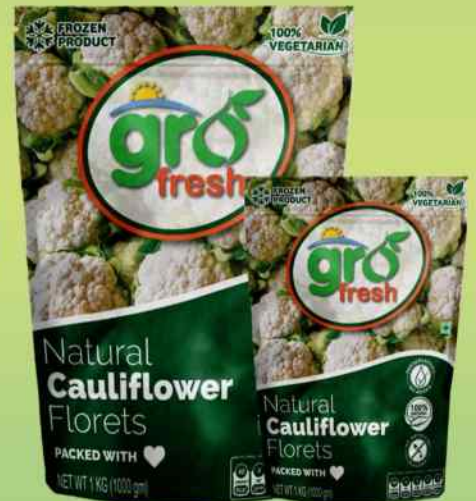
Frozen Cauliflower Florets