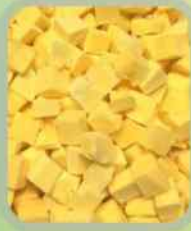
IQF TOTAPURI MANGO DICE