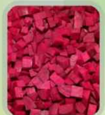
IQF BEETROOT DICE