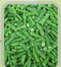
IQF GREEN BEANS CUTS