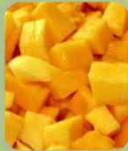
IQF ALPHONSO MANGO CHUNKS