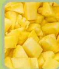
IQF PINEAPPLE CHUNKS