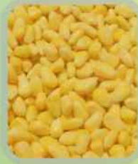
IQF WHOLE SWEET CORN KERNEL