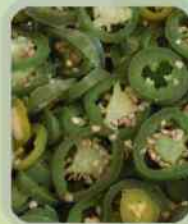
IQF JALAPENO RINGS