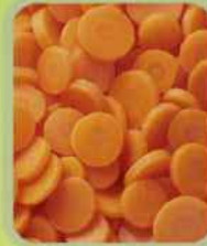
IQF CARROT SLICE