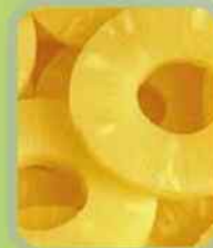
FROZEN PINEAPPLE SLICE