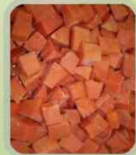
IQF PAPAYA CHUNKS