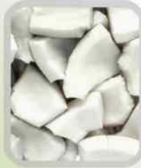
IQF COCONUT CHUNKS