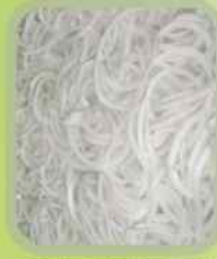
IQF TENDER COCONUT MALAI