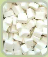
IQF COCONUT DICE