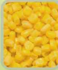
IQF CUT SWEET CORN KERNEL