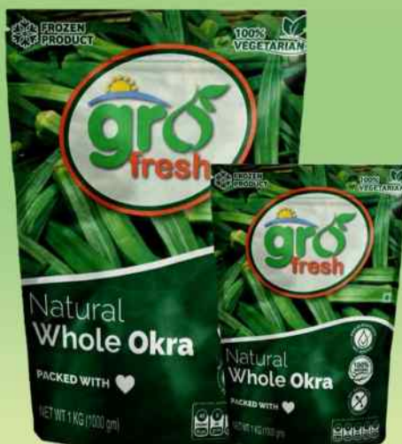
Frozen Whole Okra