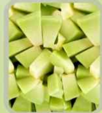
IQF HONEY DEW CHUNKS