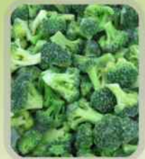
FROZEN BROCCOLI FLORETS