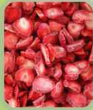
IQF STRAWBERRY SLICE