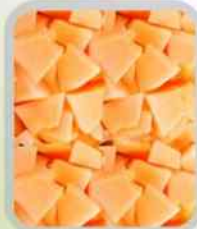
IQF CANTALOUPE CHUNKS