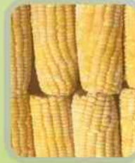
FROZEN CORN ON COB