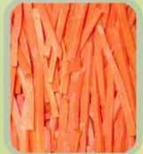
IQF CARROT STRIPS