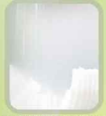
FROZEN TENDER COCONUT WATER