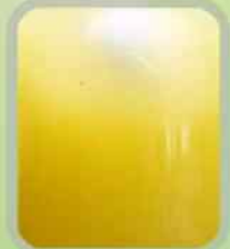
FROZEN PINEAPPLE PUREE