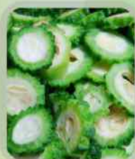
FROZEN BITTER GOURD RINGS