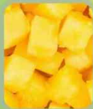
IQF PINEAPPLE DICE