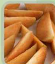
FROZEN CHICO SLICE