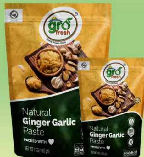
Ginger Garlic Paste