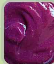
FROZEN JAMUN PUREE