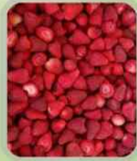
IQF WHOLE STRAWBERRY