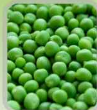
IQF GREEN PEAS