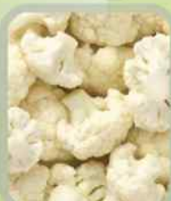
IQF CAULIFLOWER FLORETS