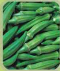
IQF WHOLE OKRA