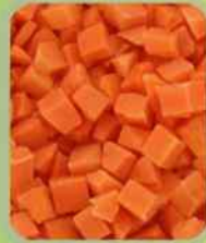
IQF CARROT DICE