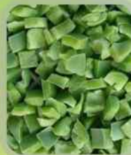
IQF JALAPENO DICE