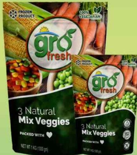
Frozen 3 Ways Mix Veg