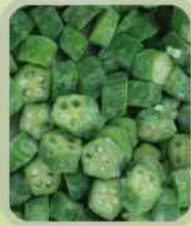
IQF CUT OKRA