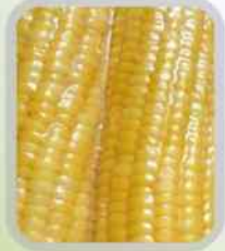
RETORT SWEET CORN