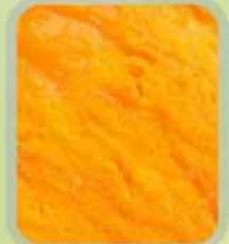
FROZEN ALPHONSO MANGO PUREE