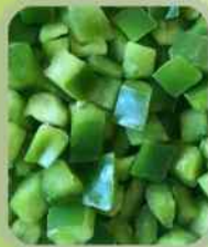
IQF CAPSICUM DICE