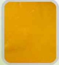
FROZEN TOTAPURI MANGO PUREE