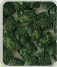
FROZEN SPINACH CUBE