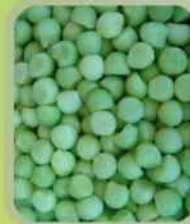
IQF HONEY DEW BALLS