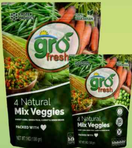
Frozen 4 Ways Mix Veg