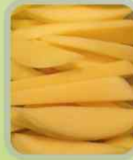
FROZEN TOTAPURI MANGO SLICE