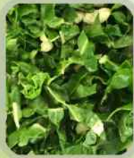
FROZEN SHREDDED SPINACH