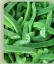
IQF CAPSICUM SLICE