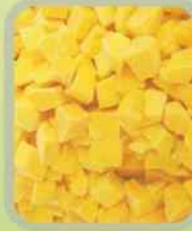
IQF TOTAPURI MANGO CHUNKS