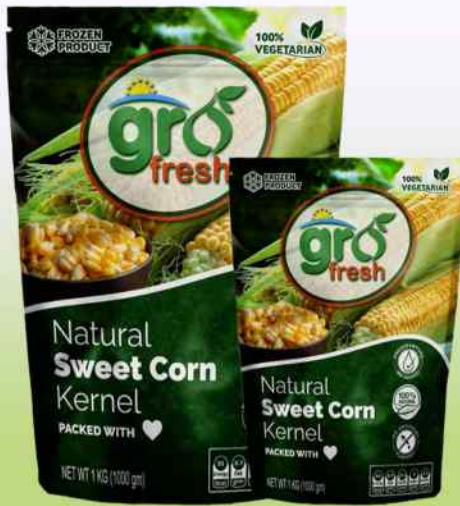
Frozen Sweet Corn Kernel