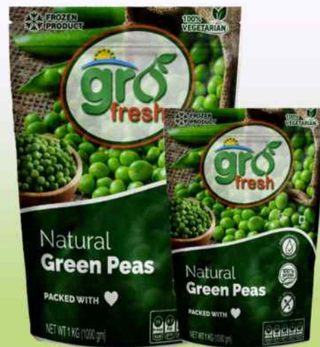
Frozen Green Peas